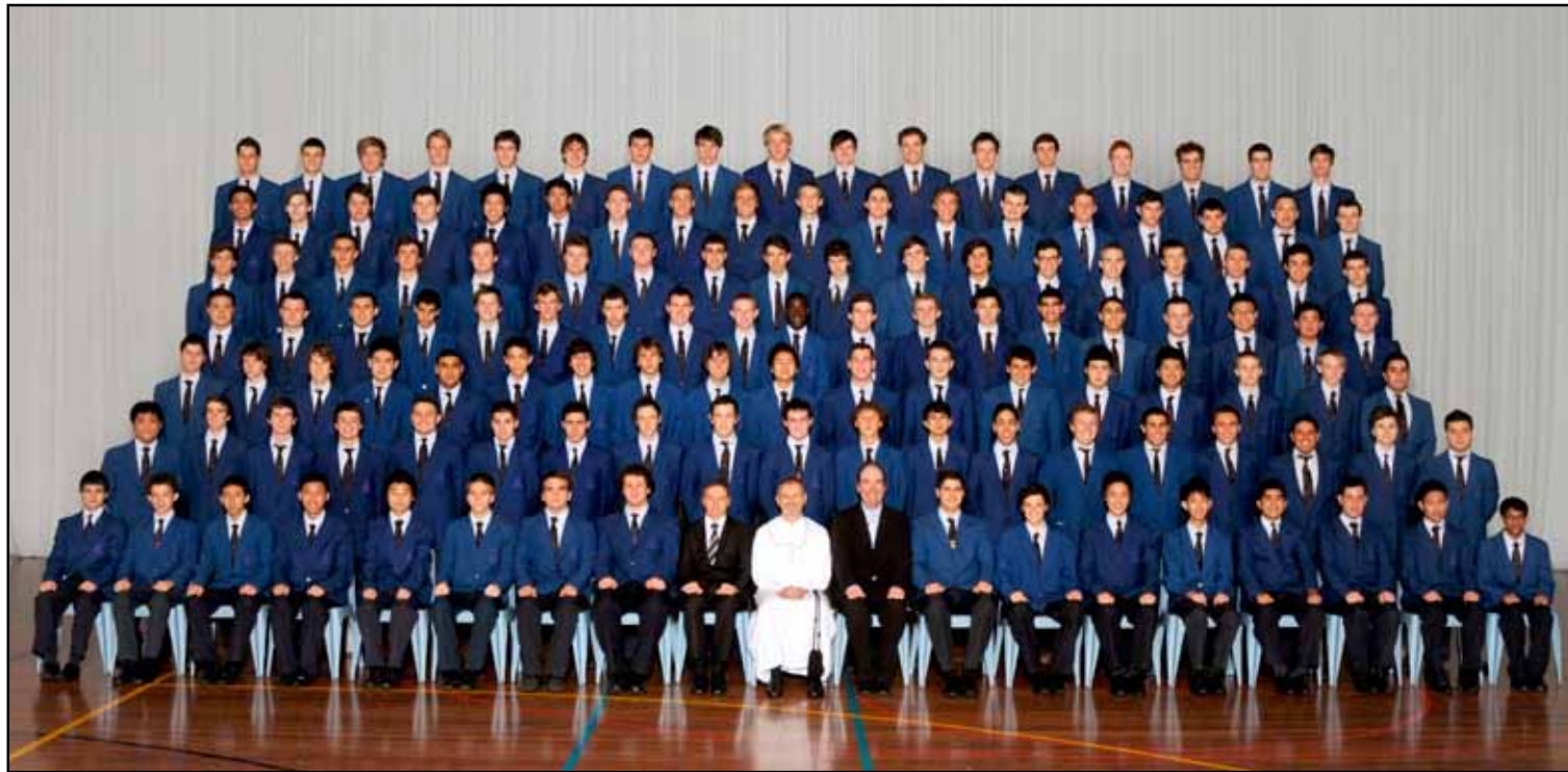
Year 12 Class of 2012