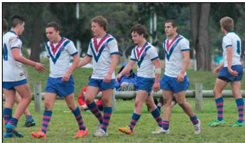
Marcellin A Grade v St Gregory's

Last term the Opens Rugby League team played their CCC semi final fixture against Patrician Brothers Blacktown. Although the team lost the game 34 to 22, I am very pleased to say that the boys did themselves and the College proud. Up against boys who regularly play in the Under 20 National Youth Competition, Marcellin performed well beyond expectation. We tackled hard and played some smart football. Unfortunately a few missed opportunities saw Marcellin finish on the wrong side of the score line. To finish in the top four of this competition is a huge achievement from the Opens team. Congratulations on their achievements this year.