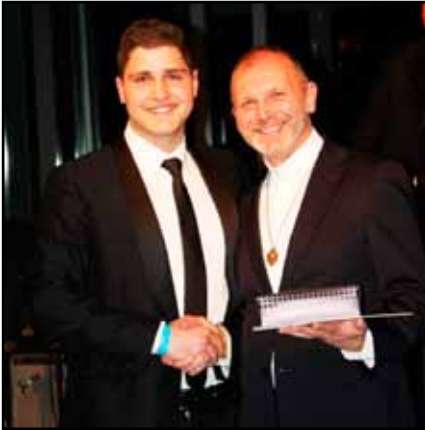
George Matouk Headmaster's Award