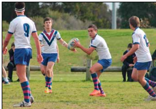
Marcellin v St Gregory's