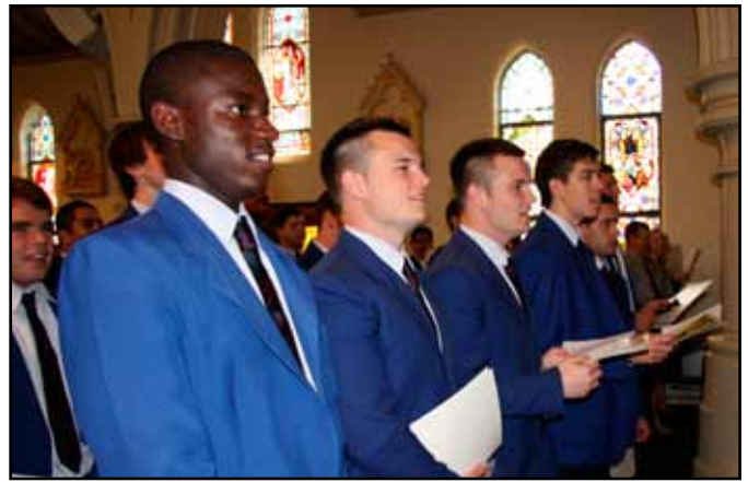
Year 12 students during Mass