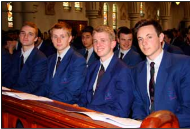
Year 12 Students at Mass