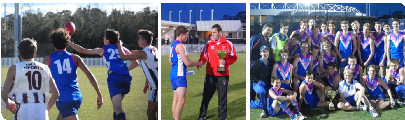
Above: Congratulations to the Under 16s AFL team - 2013 Swans Cup winners