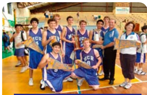
A GRADE BASKETBALL