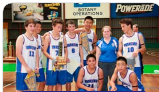
UNDER 15 BASKETBALL