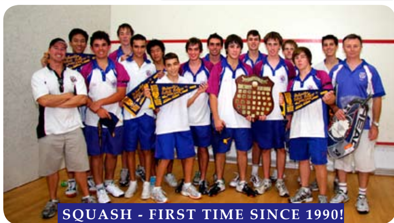
SQUASH - FIRST TIME SINCE 1990!