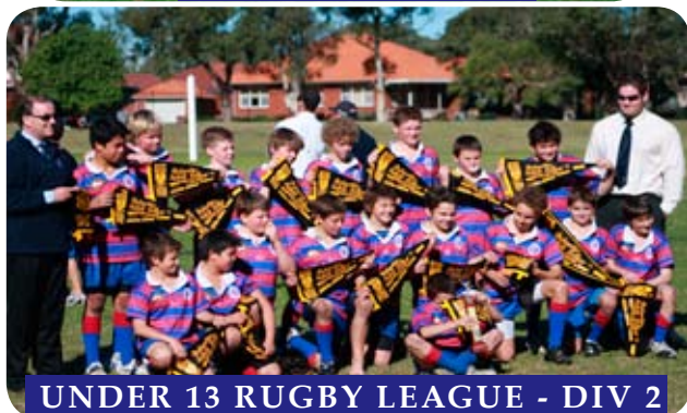
UNDER 13 RUGBY LEAGUE - DIV 2