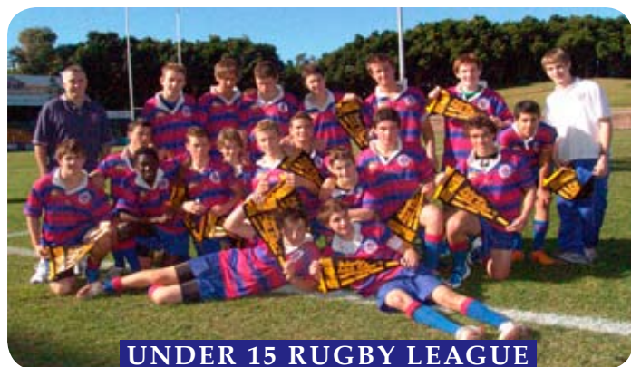
UNDER 15 RUGBY LEAGUE