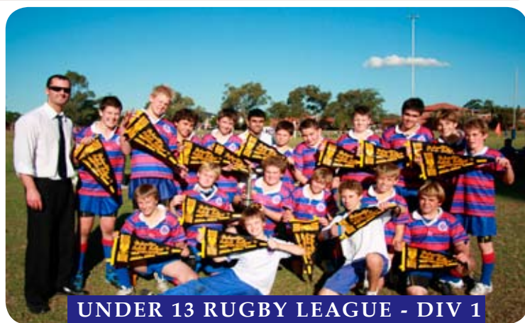
UNDER 13 RUGBY LEAGUE - DIV 1