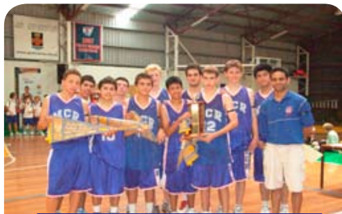
B GRADE BASKETBALL