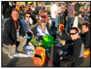
Staff at WYD 08

WYD08 without doubt was a major success not just for the 300 000 people involved in the week but for the 52 students and 6 teachers from the College who participated. The week involved many events and concluded with the students and teachers sleeping overnight at Randwick racecourse for the Papal Mass with Pope Benedict XVI. The College hosted over 500 pilgrims throughout the week from the USA, South America, Europe & Africa. Prior to WYD08, 18 Marcellin students and 5 teachers joined 800 other pilgrims for the Marist International Festival at St. Joseph's Hunters Hill.