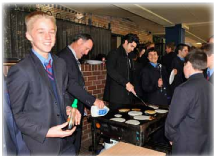
Champagnat Day BBQ